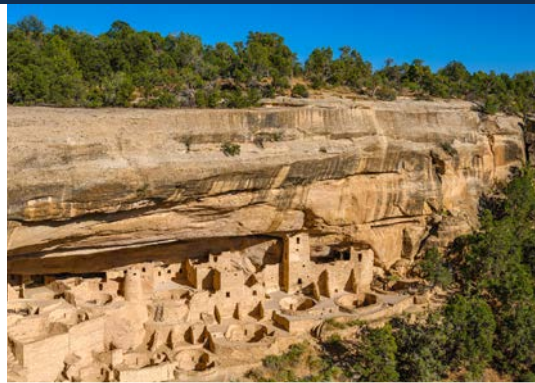
Mesa Verde National Park Colorado