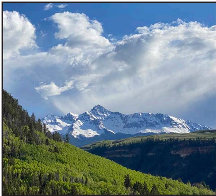
Wilson Peak, Telluride