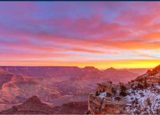
Grand Canyon National Park Arizona