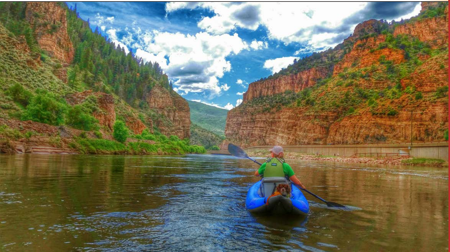
Glenwood Springs Canyon, Colorado River

Black Canyon of the Gunnison National Park Great Sand Dunes National Park Mesa Verde National Park Rocky Mountain National Park