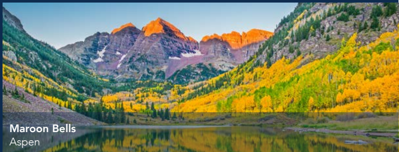
Maroon Bells Aspen