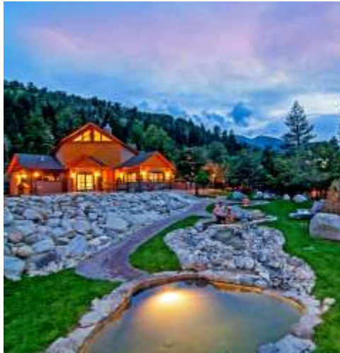
MOUNT PRINCETON HOT SPRINGS