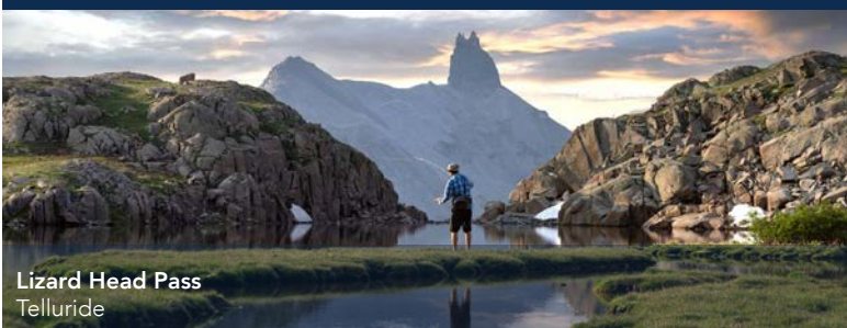
Lizard Head Pass Telluride