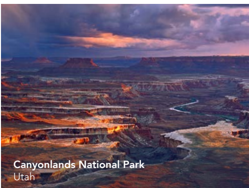
Canyonlands National Park Utah