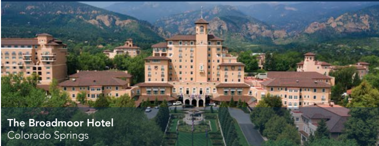
The Broadmoor Hotel Colorado Springs