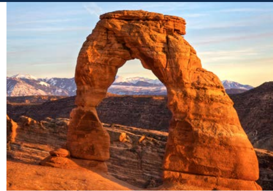
Arches National Park Utah

Welcome to our most treasured National Parks & Monuments!