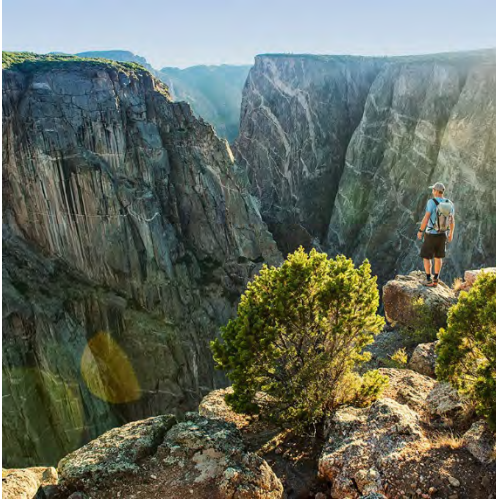
BLACK CANYON NATIONAL PARK