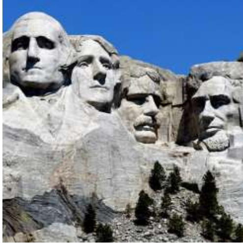
MT. RUSHMORE NATIONAL MONUMENT, SOUTH DAKOTA