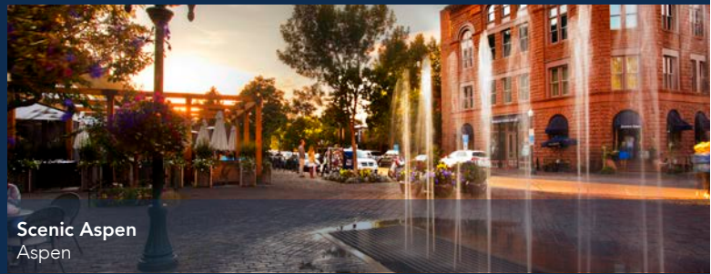
Scenic Aspen Aspen