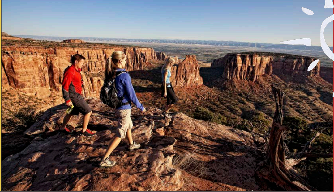
Colorado National Monument