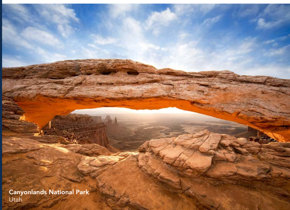
Canyonlands National Park Utah