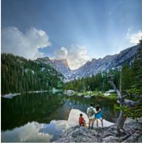
ROCKY MOUNTAIN NATIONAL PARK, COLORADO