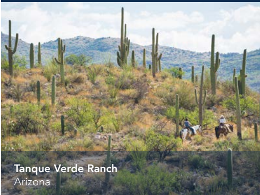
Tanque Verde Ranch Arizona

As you travel through iconic destinations and the breathtaking landscape, consider including these luxury add-ons through your multistate adventure.