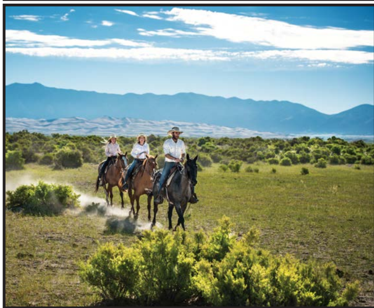
Great Sand Dunes National Park