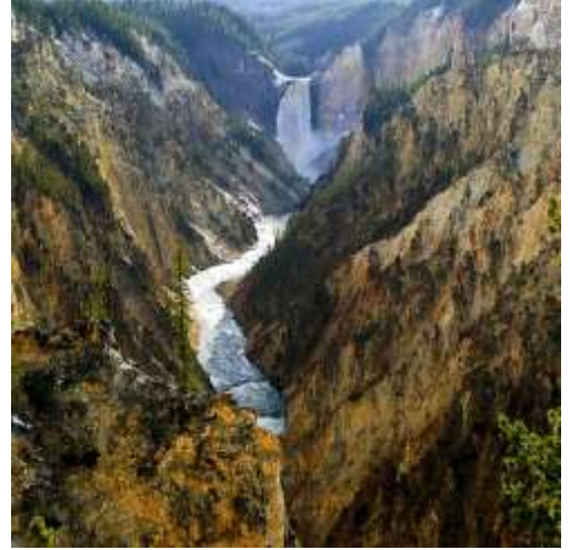
YELLOWSTONE NATIONAL PARK, WYOMING