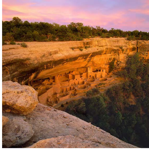
MESA VERDE NATIONAL PARK