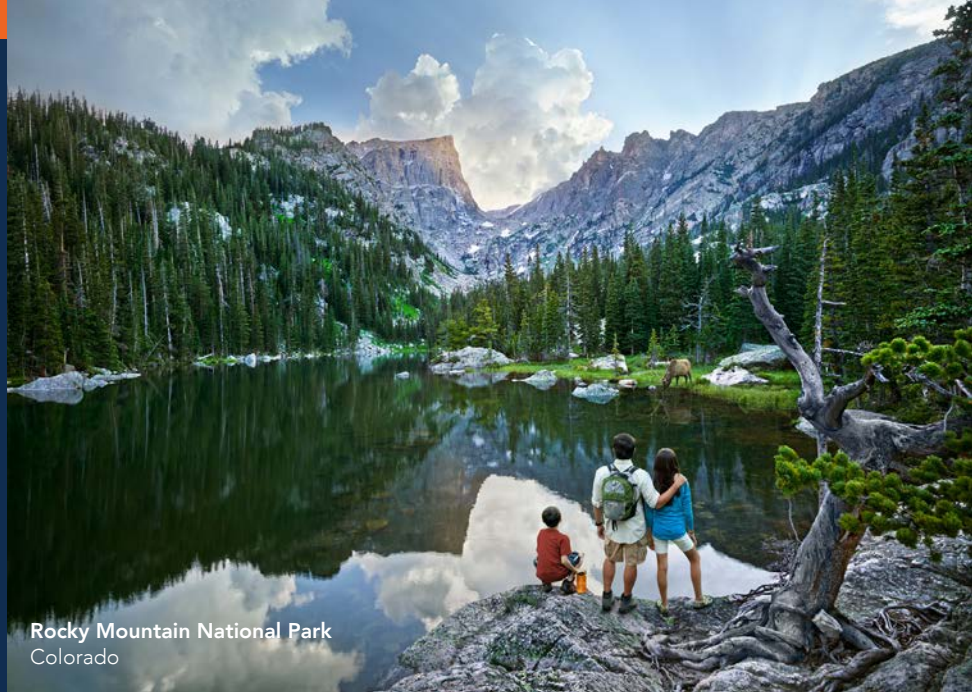
Rocky Mountain National Park Colorado