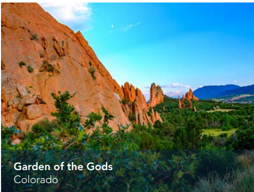
Garden of the Gods Colorado