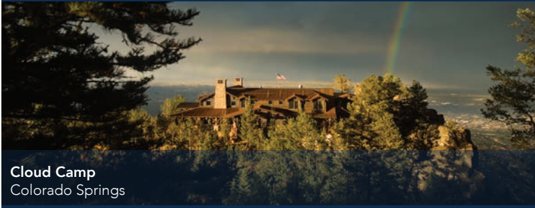
Cloud Camp Colorado Springs