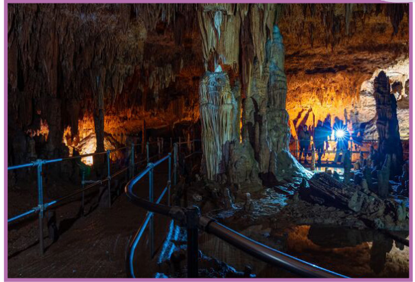
Onondaga Cave State Park

Gateway Arch National Park in St. Louis is a stunning tribute to the pioneering spirit of America. Dominated by the iconic Gateway Arch, this park symbolizes the westward expansion of the United States and offers breathtaking views of the Mississippi River and the city skyline. Visitors can ascend to the top of the 630-foot arch for panoramic vistas or explore the interactive exhibits in the museum below, which detail the rich history of the American frontier. The park also features beautifully landscaped grounds, perfect for leisurely strolls, picnics, and riverfront activities, making it a vibrant and educational destination for all ages.