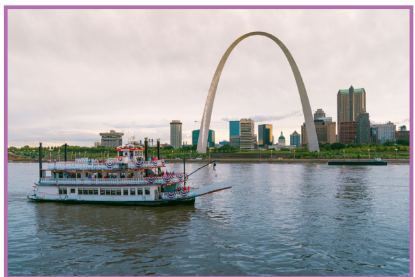
Gateway Arch National Park