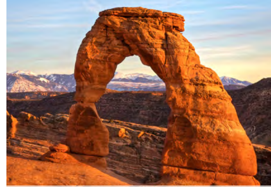
Arches National Park Utah

Welcome to our most treasured National Parks & Monuments!