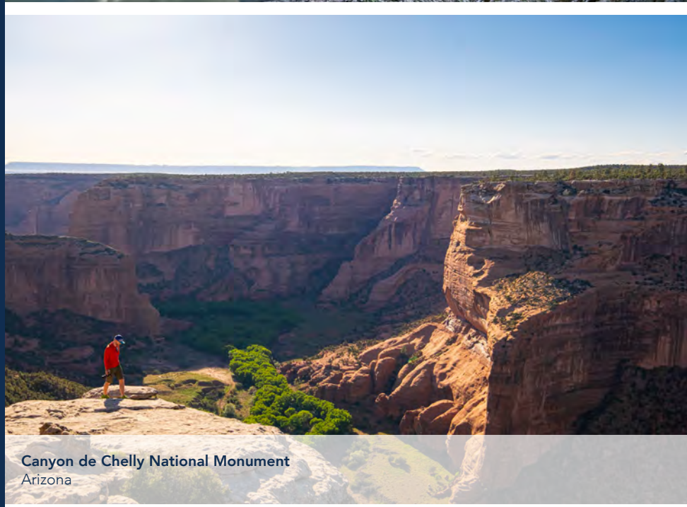
Canyon de Chelly National Monument Arizona