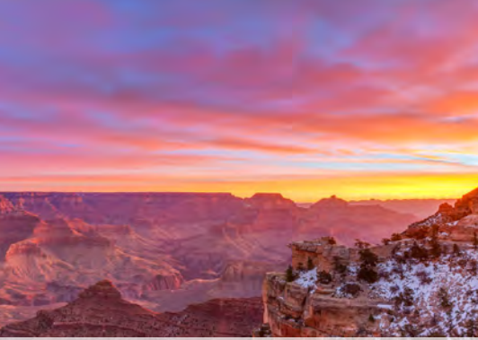
Grand Canyon National Park Arizona