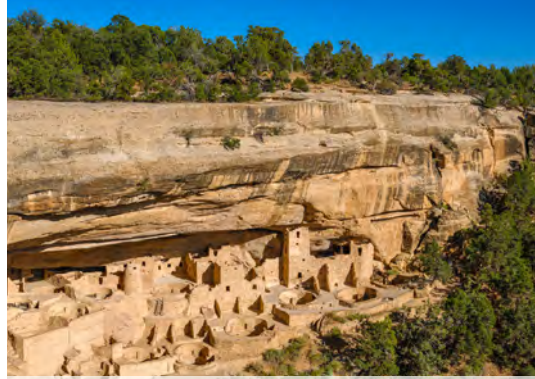
Mesa Verde National Park Colorado