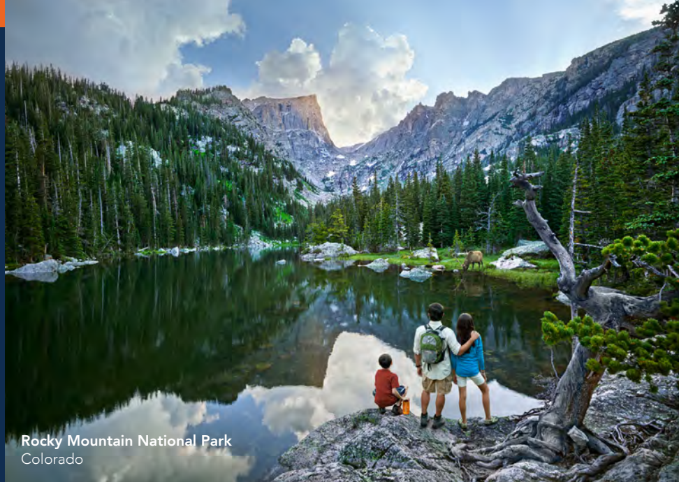
Rocky Mountain National Park Colorado