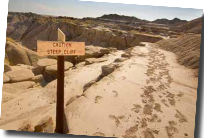
Toadstool Geologic Park near Harrison

Chief Crazy Horse. It also served as the Red Cloud Indian Agency, a cavalry remount station, K-9 dog training center, POW camp, and beef research station. One of the most remote and scenic destinations in northwest Nebraska is Toadstool Geologic Park, located in the Oglala National Grassland. This moonscape region contains badlands landscape of unique rock formations, some in the shape of toadstools. To many visitors it resembles a mini version of South Dakota's Badlands.