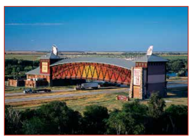
The Archway, spanning Interstate 80, Kearney

Central Nebraska's landscape is dominated by farmland and the braided Platte River, which are ideal for one of the greatest animal treks in the world, the sandhill crane migration. Each spring more than one million sandhill cranes descend onto central Nebraska from mid-February to mid-April to relax, refresh, and refuel to continue their migration from their wintering grounds in the south to their breeding grounds in Canada, Alaska and Siberia. Grand Island's Crane Trust Nature & Visitor Center and Kearney's Rowe Sanctuary offer guided sunrise and sunset tours to view these majestic birds up close and without disturbing them in their natural habitat. This is the world's second largest animal migration and should not be missed, whether you are a birder or not.