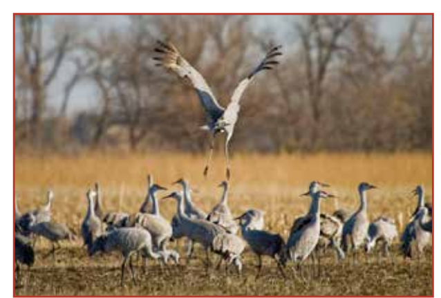
Sandhill Crane Migration in Central Nebraska